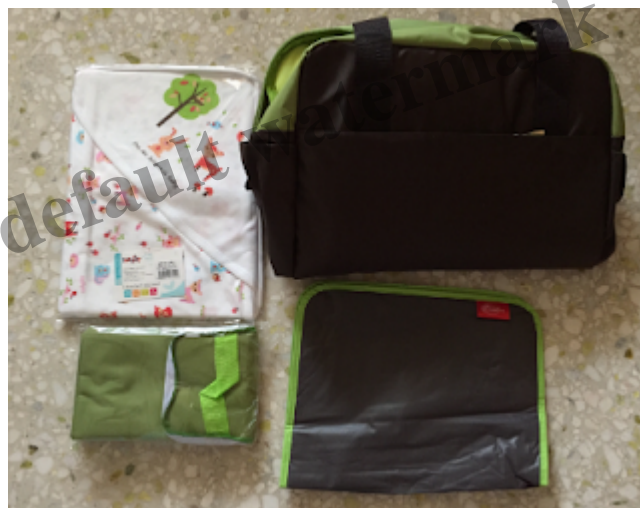
Mount Alvernia bag.