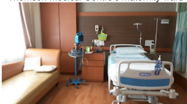
Mount Alvernia Hospital's maternity ward

Some might also feel more awkward at MAH due to their religious affiliation (it is a Catholic hospital), so I would highly encourage that you sign up for a hospital tour with the ones that you're considering so that you can get a better feel of the vibes in person for yourself.