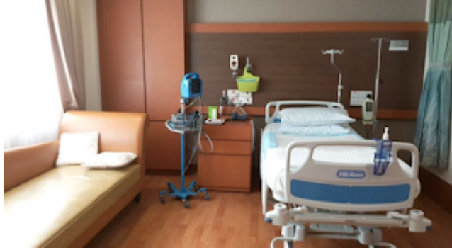
Mount Alvernia Hospital's maternity ward

Some might also feel more awkward at MAH due to their religious affiliation (it is a Catholic hospital), so I would highly encourage that you sign up for a hospital tour with the ones that you're considering so that you can get a better feel of the vibes in person for yourself.