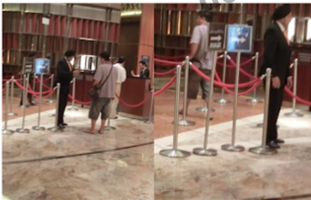
A flip-flop wearing gambler is allowed past checks into the Marina Bay Sands casino

I LOVE shorts and slippers, and the fact that I can wear them almost anywhere in Singapore using the heat as an excuse is a super big bonus. I even wear them to teach my tuition kids all the time!