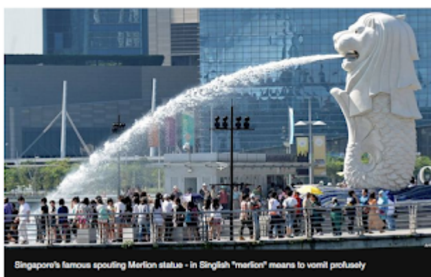
Singapore's famous spouting Merlion statue - in Singlish "merlion" means to vomit profusely