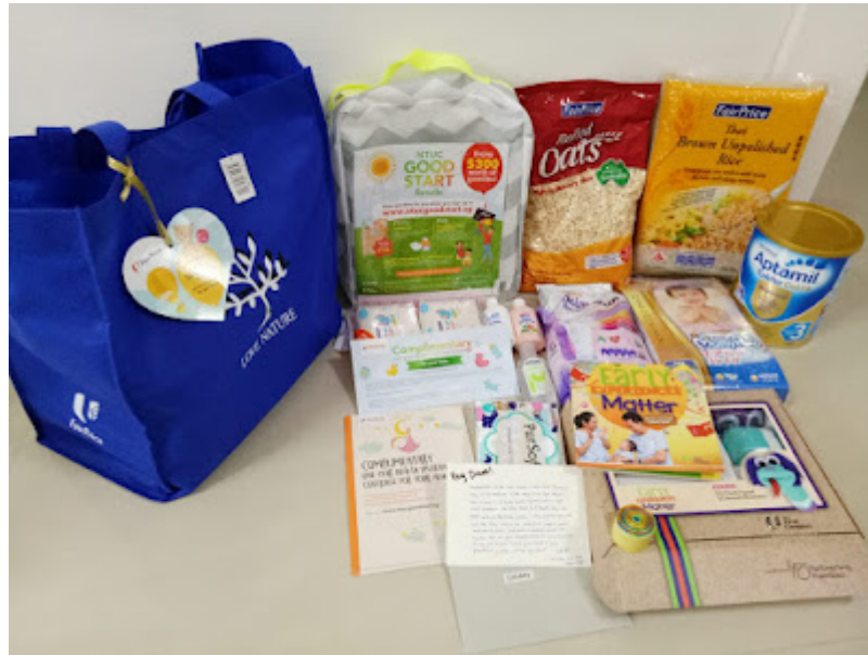
Here's my bundle, given to me as a press kit for this review