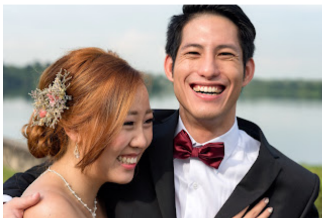
My pre-wedding photo by Cepheus Chan Photography . Makeup by Team Bride SG .

photos that capture the essence of “happiness” in an instant.