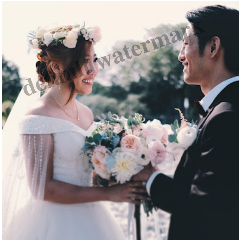
My absolutely gorgeous wedding gown with a shoulder veil and a long trailing train. Would you believe this came from Taobao?

Option C: Rent from a budget studio like TheWarehouseBridal