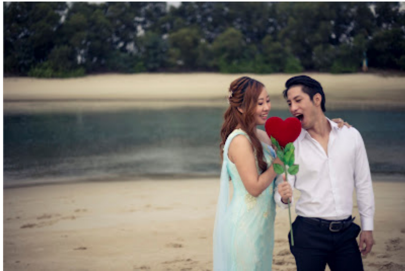
My pre-wedding shoot

And in case you're curious on the MUA I eventually decided to use, I selected Team Bride SG . My pre-wedding look that she did for me is below: