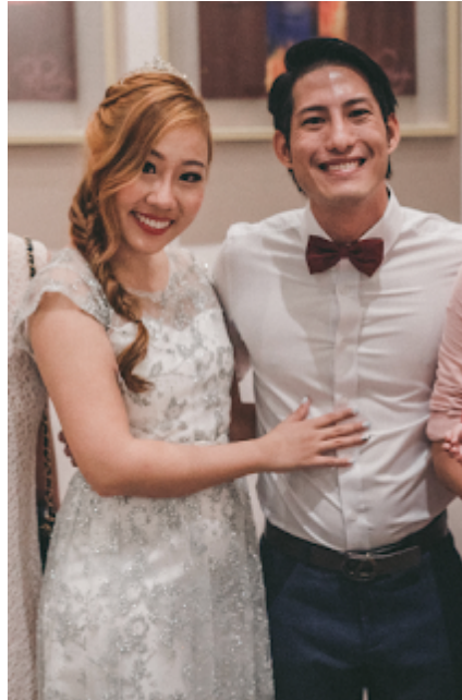
One of my AD bridal looks (my MUA did 1 day + 2 evening looks)