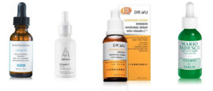
SKINCEUTICALS Serum 10 30ml S$178.00