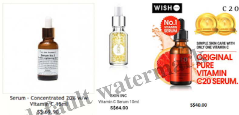
Serum - Concentrated 20% w/w Vitamin C 15ml S$69.90