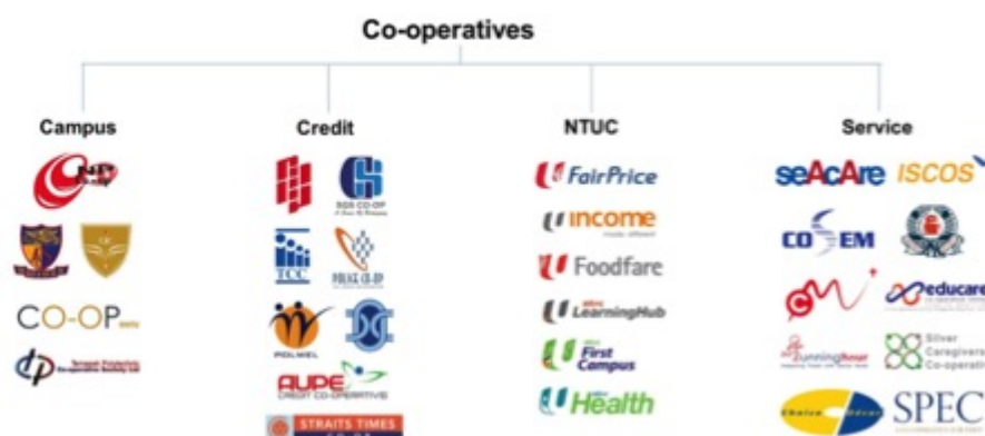
Some examples of Co-ops

There are plenty of co-ops available in Singapore, but they generally fall under these categories: