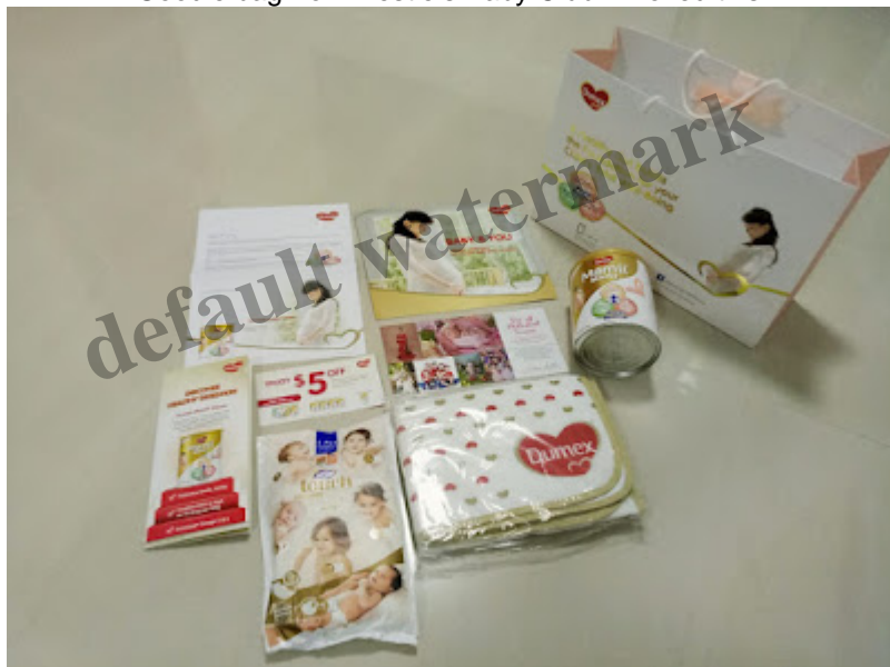
Dumex sample + changing mat + a really useful pregnancy guidebook.