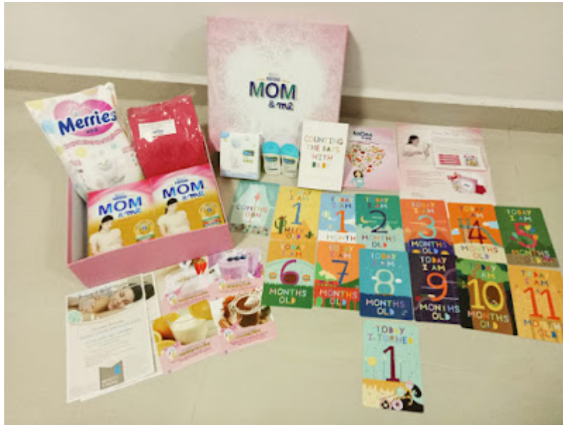
Goodie bag from Nestle's Baby Club...I loved this!