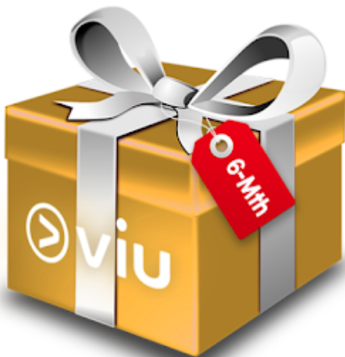
6-Month Viu Premium eGift Card