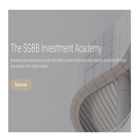
The SGBB Investment Academy