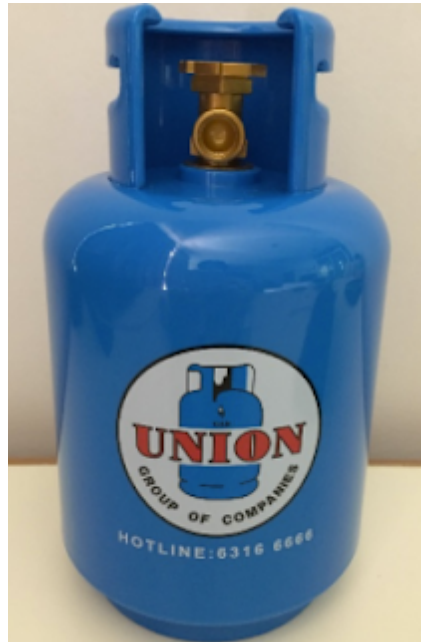
Photo Credits . This is a coin bank but you get my drift la.

They're a familiar brand name to most people so there's no need for much introduction.