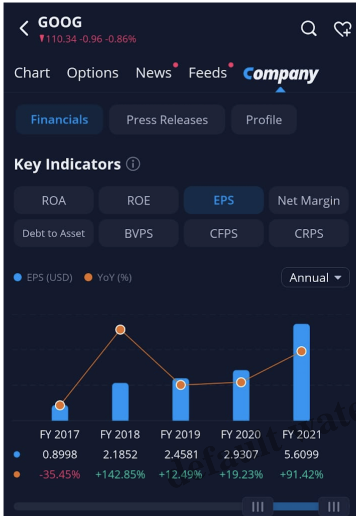
Analyze financial ratios at a glance.