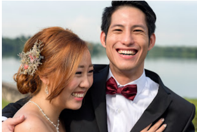
My pre-wedding photo . Makeup by Team Bride SG .

photos that capture the essence of “happiness” in an instant.