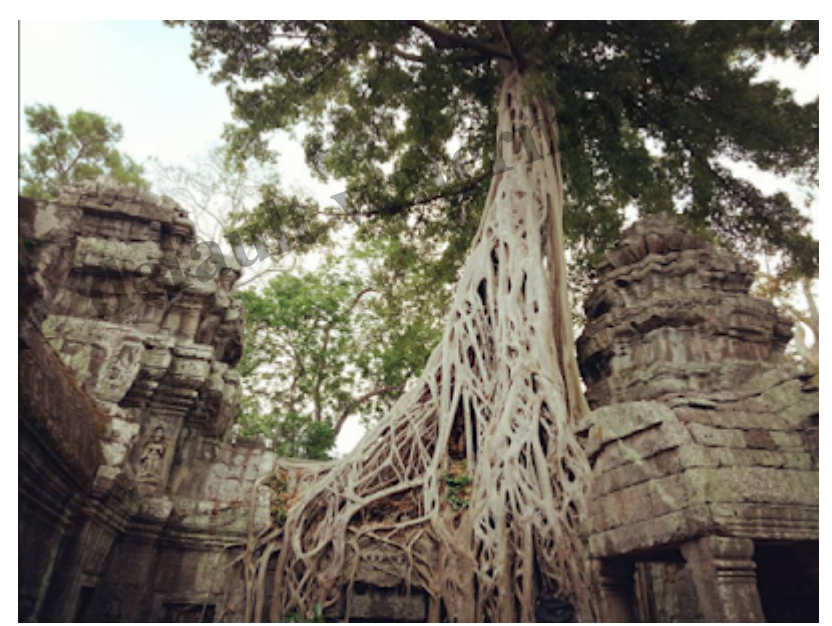
Ta Phrom – more famously known as the site of filming for Angelina Jolie's Tomb Raider