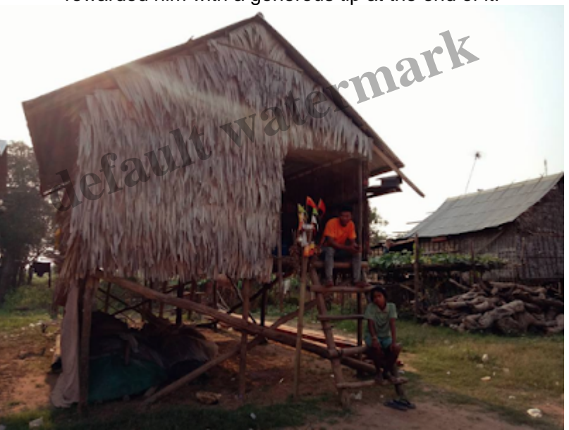
Olden-style houses in the fishing village