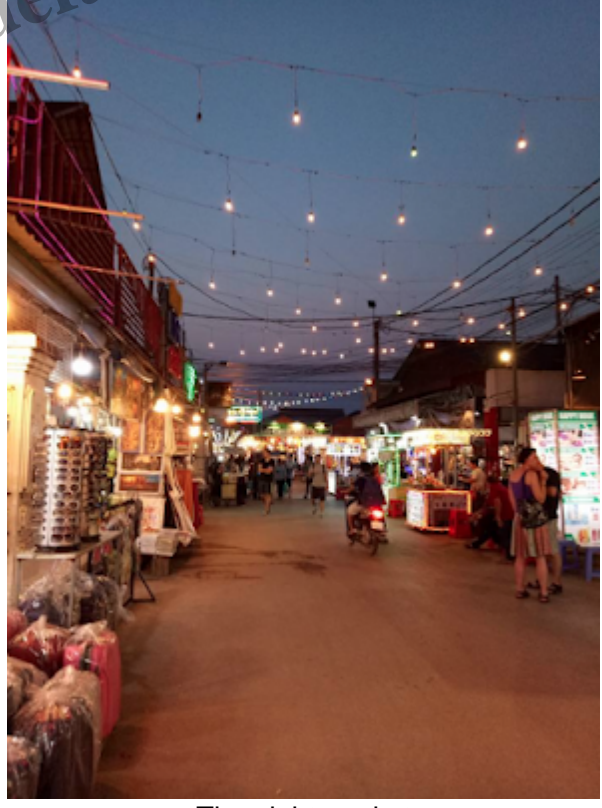
The night market