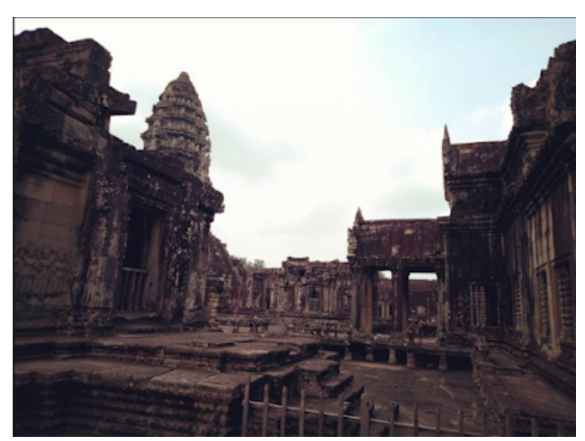
The inner temple grounds