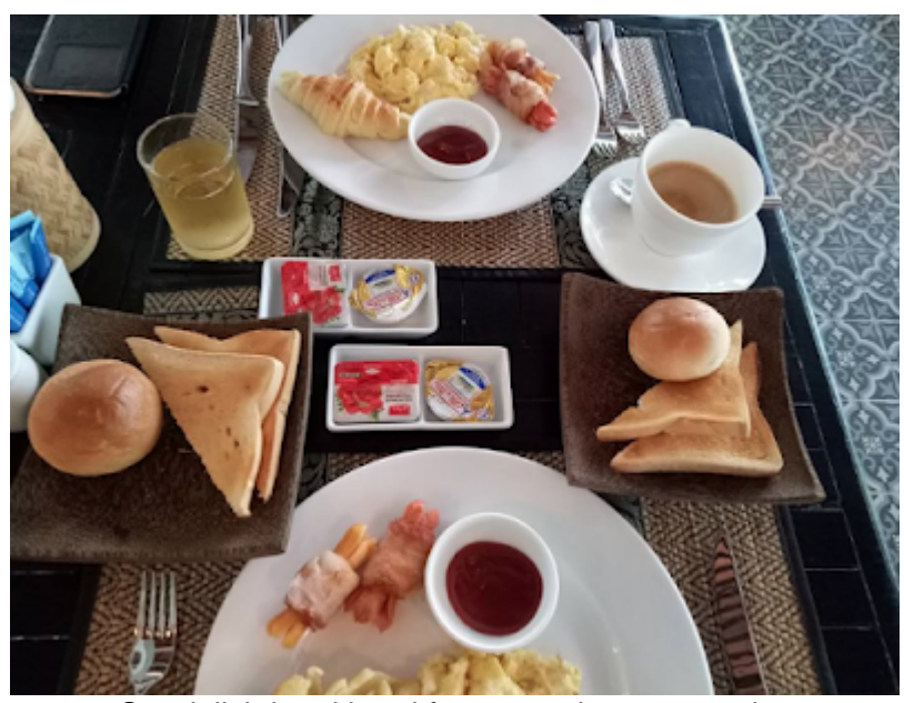
Our delish hotel breakfast spread every morning

Beer is as cheap as USD 0.50 in many bars along Pub Street, and you'll find most dishes ranging from $3 at the local restaurants to $8 at the international ones. I didn't try too much of the street food since I had a weak stomach, but for those of you who are game enough, you can try nibbling on their fried scorpions / tarantula spider / snails for the fear factor!