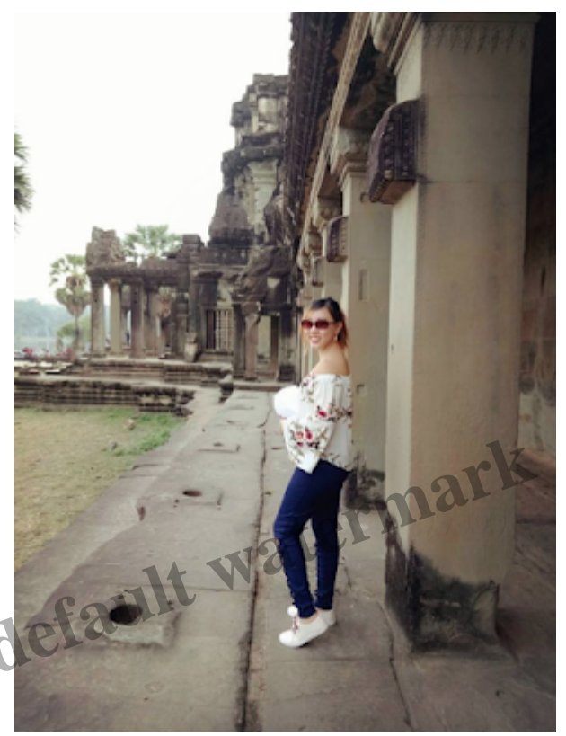
Starting the morning at Angkor Wat and ready to trek the temple grounds!

We used Klook for our tour bookings and the prices were the same, if not cheaper, than what was offered to us by the local tour agency offices which we enquired with in Siem Reap. I'm not sponsored by Klook for this trip but I've used them on so many holidays and really recommend booking with them for the quality and competitive prices they offer.