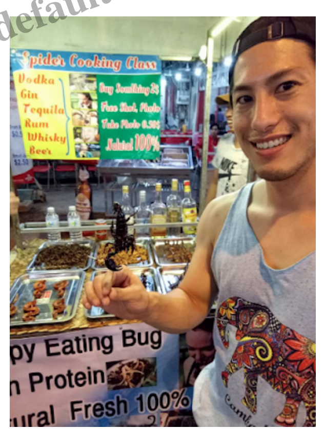
My husband tried the scorpion (USD 2 with a shot of hard liquor)

Beer is as cheap as USD 0.50 in many bars along Pub Street, and you'll find most dishes ranging from $3 at the local restaurants to $8 at the international ones. I didn't try too much of the street food since I had a weak stomach, but for those of you who are game enough, you can try nibbling on their fried scorpions / tarantula spider / snails for the fear factor!