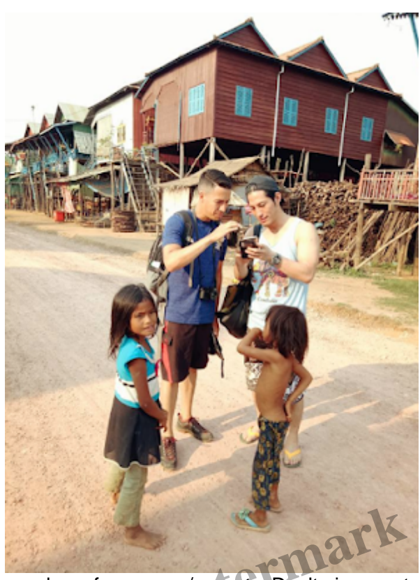
The kids will run up to you and hound you for money / sweets. Don't give any to them unless you're prepared to have a whole swarm surround you the next minute!