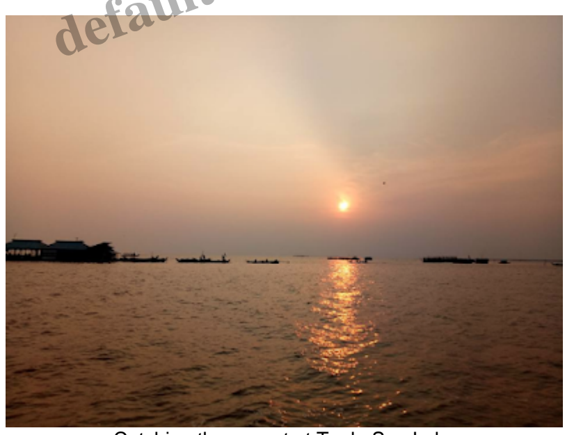
Catching the sunset at Tonle Sap Lake