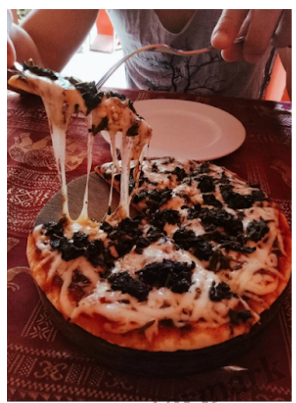
and weed (happy) pizza too

We particularly enjoyed this family-owned restaurant that is located across the street from Nature Republic, which served such yummy local food that we went back twice during our trip. Dishes are mostly USD 3 each, and our entire meal pictured below with my avocado shake cost us only USD 10.50!