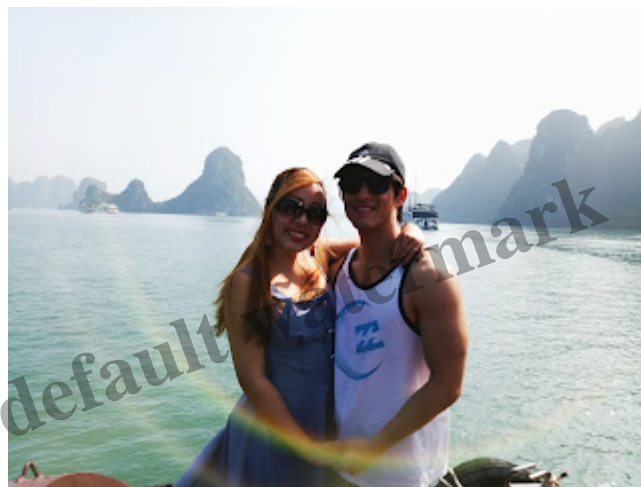
Us at Halong Bay