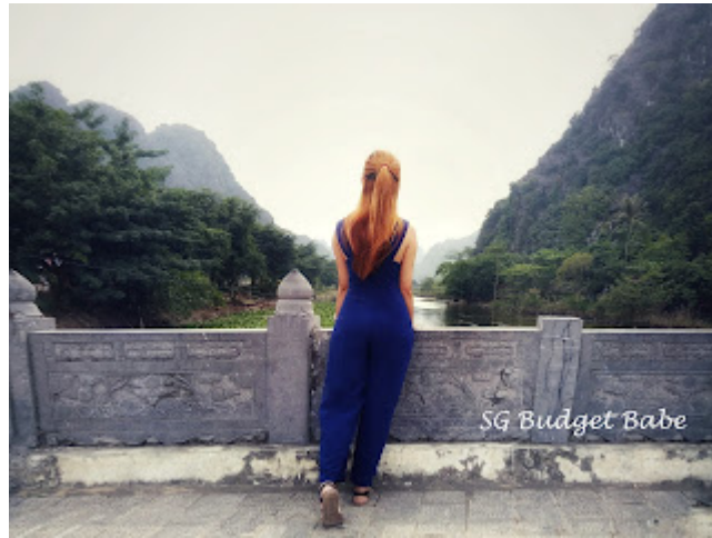
Against the backdrop of Hoa Lu