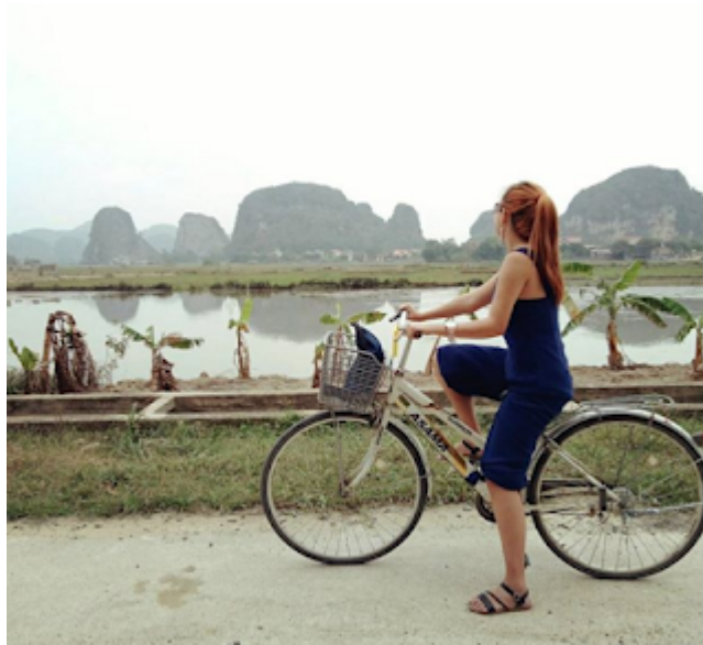
Cycling in Tam Coc to see the limestone sights.