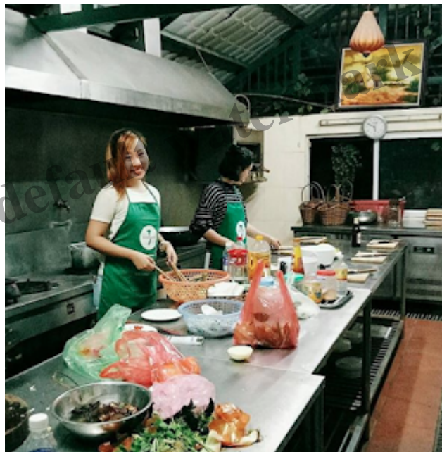
Click here to check out what we whipped up!