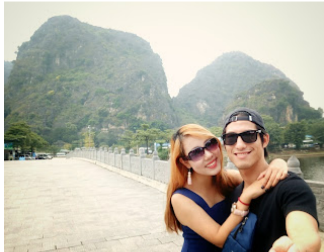
Us at Hoa Lu, the old capital of Vietnam