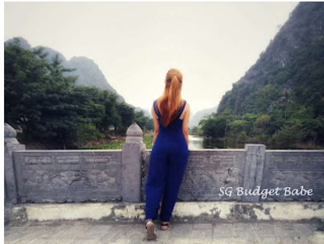
Against the backdrop of Hoa Lu