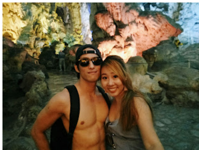
At a beautiful cave we explored while on our Halong Bay tour with Klook