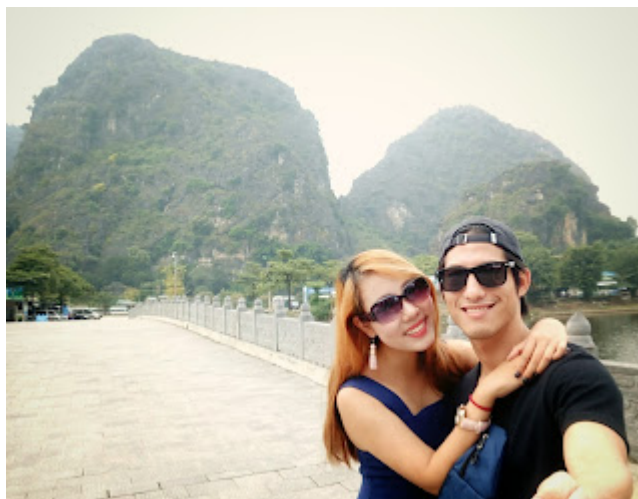
Us at Hoa Lu, the old capital of Vietnam