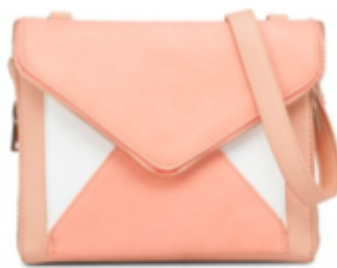
Something Borrowed Colourblocked Zone Crossbody