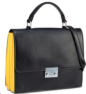
EXCLUSIVE X'MAS COLLECTION Something Borrowed Contrast Gusset Bag