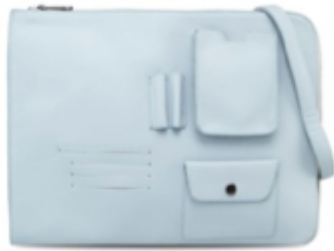
Something Borrowed Compartment Sleeve Clutch

BUY SOMETHING BORROWED FOR WOMEN: (2598 ITEMS FOUND)