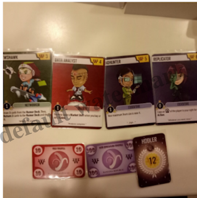
Here's my winning shot!

Lastly, we also had the rumours, which all of us engaged in. As I've highlighted before, rumour mongering is extremely common in cryptocurrencies, and that's why there are so many people falling for scam coins aplenty (some of which I've exposed on this blog before). In the game, we had the chance to deploy one open or hidden rumour card on each crypto coin, and the race was on to make a particular coin become THE scam coin of the game so that the player who HODL (held on for dear life) onto the coin would lose money.