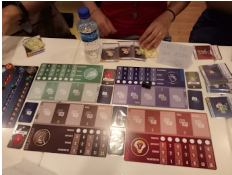
Our table shot.

If you're looking for a fun and light-hearted way to learn about the new economy of cryptocurrencies, this board game would be perfect. My only gripe is that given the level of the concepts being taught, the makers seem to be aiming a little too high when they say this game was designed to be suitable from secondary school level and up, because I feel as though it'll be too hard for them to grasp.