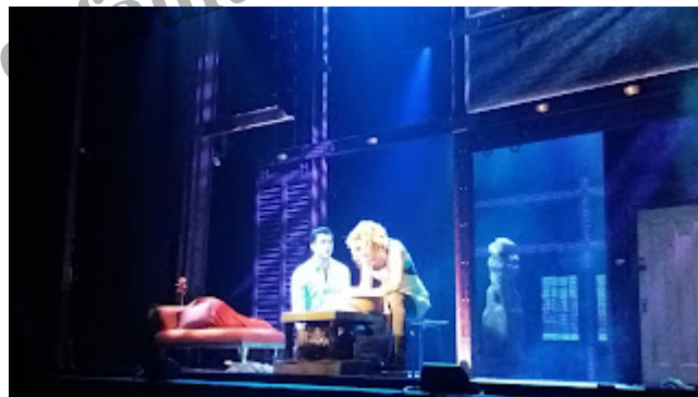
The classic scene! Fans who caught the movie will recognize this. My boyfriend got super excited when this was about to happen.

You'll be able to distinguish clearly between who's a "ghost" and those alive thanks to the clever lighting employed throughout the show. No expense was spared in the lighting and stage props. There was great detail to every prop, which I enjoyed scrutinizing. I can only imagine all the hours spent rehearsing and creating all of these props.