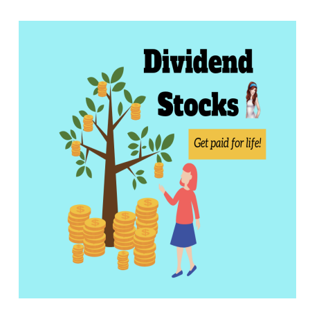
Getting Paid For Life