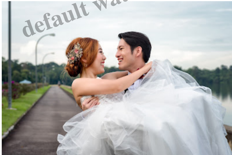
taken during my PWS. We pulled this off for under $500.

Outfits & props: For budget rentals of wedding gowns or evening gowns, try The Warehouse Bridal or www.stylelease.com.sg . To buy your own outfits, there are plenty of stores you can check out for pretty clothes, including The Velvet Dolls, The Closet Lover, ASOS. For props, you can score some really fantastic stuff from Daiso, Taobao, Carousell, or even The Salvation Army Thrift Store (if you're willing to brave a hot and dusty room to source for hidden gems). For flowers, you can get really pretty (albeit artificial) ones from NTUC Fairprice, or real ones on a budget from your wet market florist, Cold Storage or Far East Flora to assemble yourself.