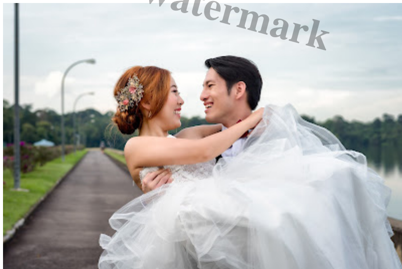
Photo by Cepheus Chan Photography taken during my PWS. We pulled this off for under $500.

Outfits & props: For budget rentals of wedding gowns or evening gowns, try The Warehouse Bridal or www.stylelease.com.sg . To buy your own outfits, there are plenty of stores you can check out for pretty clothes, including The Velvet Dolls, The Closet Lover, ASOS. For props, you can score some really fantastic stuff from Daiso, Taobao, Carousell, or even The Salvation Army Thrift Store (if youâ??re willing to brave a hot and dusty room to source for hidden gems). For flowers, you can get really pretty (albeit artificial) ones from NTUC Fairprice, or real ones on a budget from your wet market florist, Cold Storage or Far East Flora to assemble yourself.