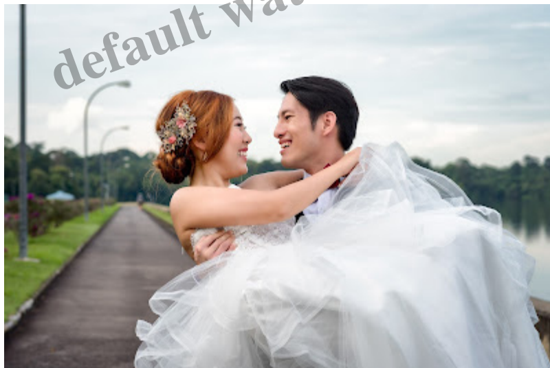
taken during my PWS. We pulled this off for under $500.

Outfits & props: For budget rentals of wedding gowns or evening gowns, try The Warehouse Bridal or www.stylelease.com.sg . To buy your own outfits, there are plenty of stores you can check out for pretty clothes, including The Velvet Dolls, The Closet Lover, ASOS. For props, you can score some really fantastic stuff from Daiso, Taobao, Carousell, or even The Salvation Army Thrift Store (if you're willing to brave a hot and dusty room to source for hidden gems). For flowers, you can get really pretty (albeit artificial) ones from NTUC Fairprice, or real ones on a budget from your wet market florist, Cold Storage or Far East Flora to assemble yourself.