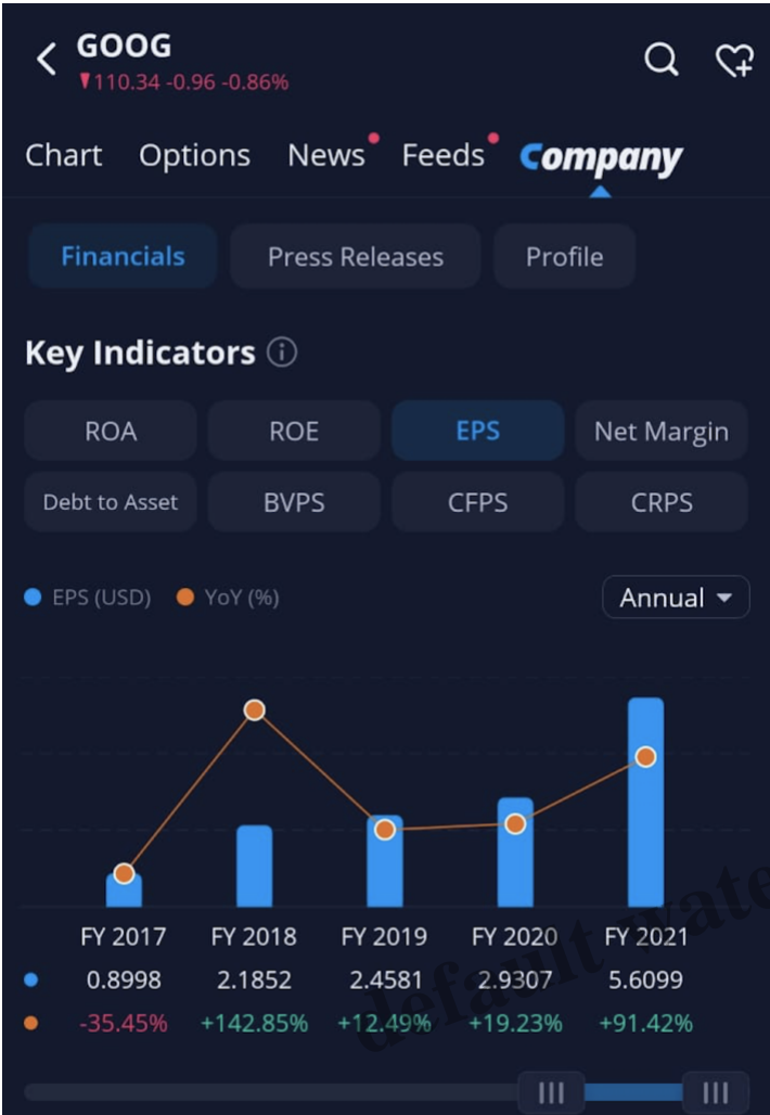
Analyze financial ratios at a glance.