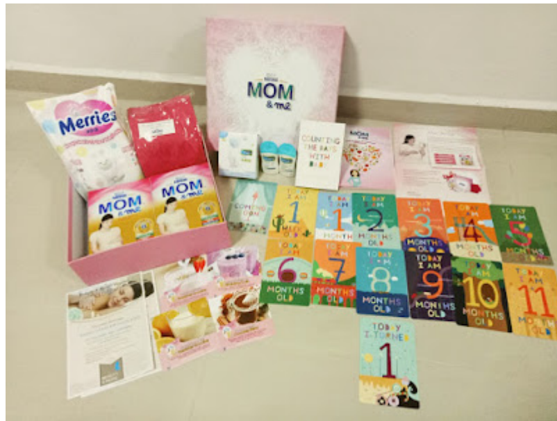
Goodie bag from Nestle's Baby Club...I loved this!