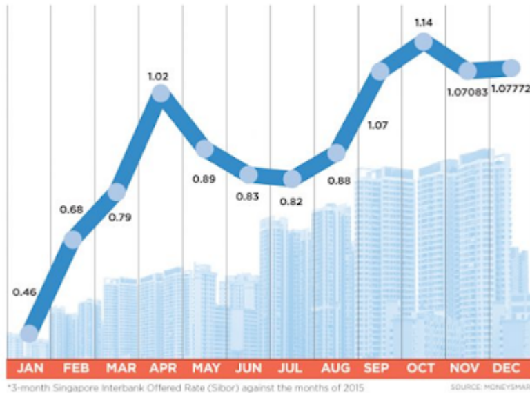
SIBOR FOR 2015* (in per cent)

The SIBOR has been on a continuous uptrend over the past year, and with the Fed looking to raise interest rates, the SIBOR is very likely to continue going up. This is bad news, as a rising SIBOR rate will lead to higher interest payments for us consumers. No thanks.