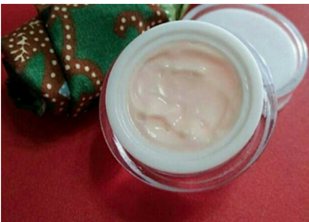
BE PROTECTED - Rose Moisturiser with Sunblock (SPF)

So I had no choice but to use chemical sunscreens for the beaches. Biore's newest gel sunscreen initially served me well when I was at Langkawi earlier this year, but on the third day I started breaking out again despite masking regularly in my hostel room . Thus, I officially gave up.