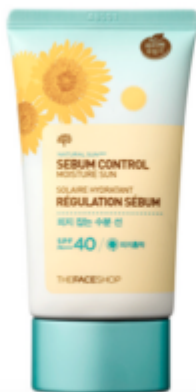
The Face Shop Natural Sun Eco Sebum Control Moisture Sun Cream SPF 40 PA+++ , $23.90