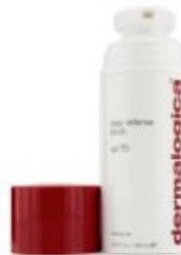
Dermalogica Daily Defense Block SPF 15