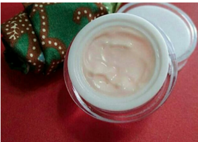
BE PROTECTED - Rose Moisturiser with Sunblock (SPF) $20.90 Shipping fee included

So I had no choice but to use chemical sunscreens for the beaches. Biore's newest gel sunscreen initially served me well when I was at Langkawi earlier this year, but on the third day I started breaking out again despite masking regularly in my hostel room . Thus, I officially gave up.