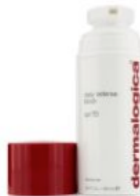
Dermalogica Daily Defense Block SPF 15