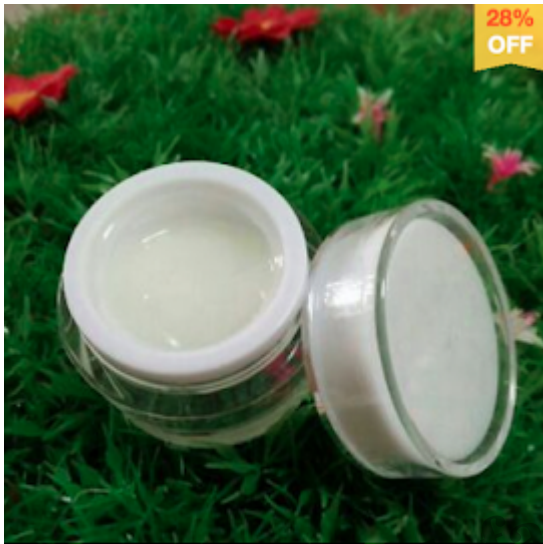
BE PROTECTED - SPF Gel Moisturiser

You already know why I'm blogging about this – it is not everyday you see $5 organic sunscreens on sale!