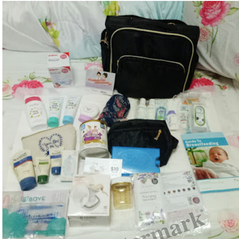
TMC's Breastfeeding Essentials discharge bag

For those who are interested at Mount Alvernia a few days