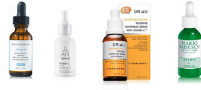
SKINCEUTICALS Serum 10 30ml S$178.00