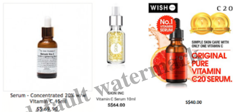
Serum - Concentrated 20% w/w Vitamin C 15ml S$69.90